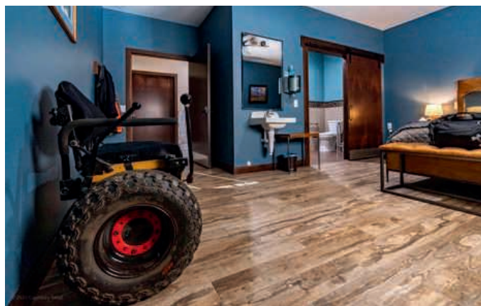
A handicap accessible bedroom at Wings of Valor lodge

To apply for a hunt or learn more about Wings of Valor Lodge, go to www.wingsofvalordodge.org .