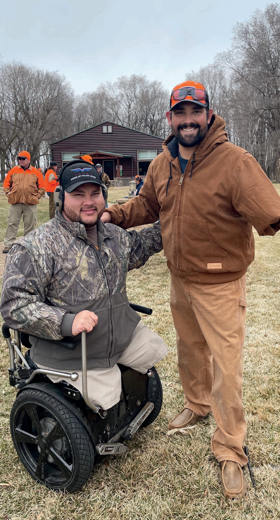
Veterans enjoying their stay at Wings of Valor.