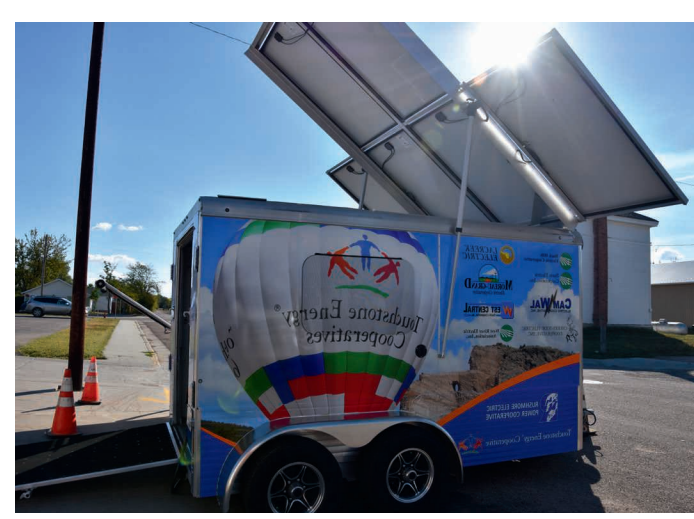
The solar trailer has been featured at several co-op public outreach events.

More than 30 members participate in the subscription program, and because the project was entirely financed by the participating members, it won't impact other members of the co-op.