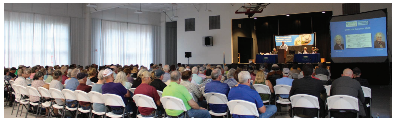
A total of 222 guests attended Lake Region Electric's 82nd Annual Meeting