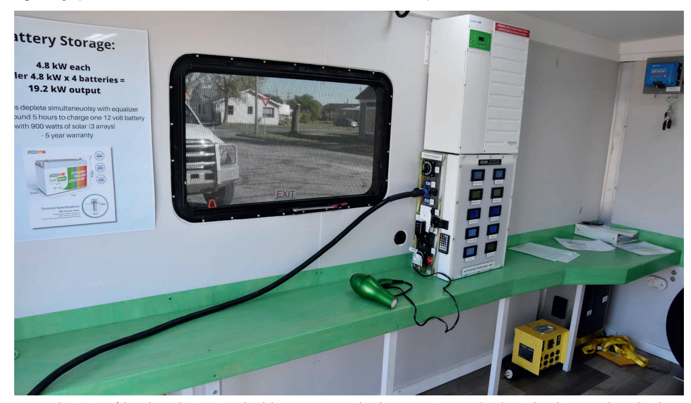
The interior of the solar trailer is equipped with battery storage and outlets – powering everyday electrical appliances, such as a hairdryer.

The landscape of renewable energy is vast and ever-changing and every co-op is planning their own approach, but with resources like the solar trailer, tools for education and engagement are within reach for members wanting to learn more.