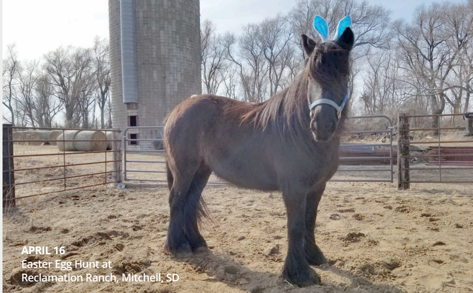
APRIL 16 Easter Egg Hunt at Reclamation Ranch, Mitchell, SD

To have your event listed on this page, send complete information, including date, event, place and contact to your local electric cooperative. Include your name, address and daytime telephone number. Information must be submitted at least eight weeks prior to your event. Please call ahead to confirm date, time and location of event.