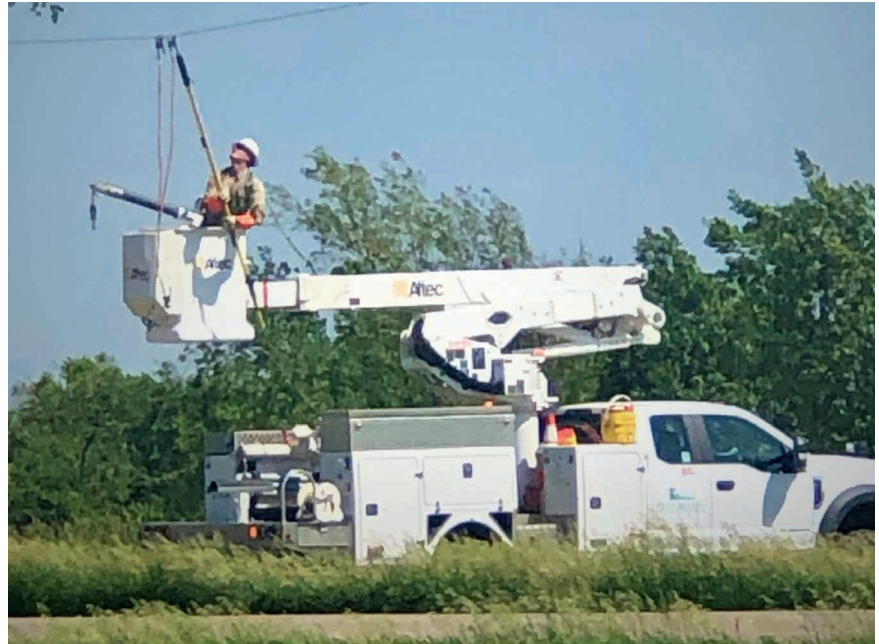
Bryce grounds a line to safely make repairs due to high winds that led to a grass fire.

A fellow lineman and I ventured out, found, and fixed the issue, despite the dangerous conditions, and restored power to the members who had been out for several hours. It was interesting the next morning trying to explain to a couple of ladies in the office how we